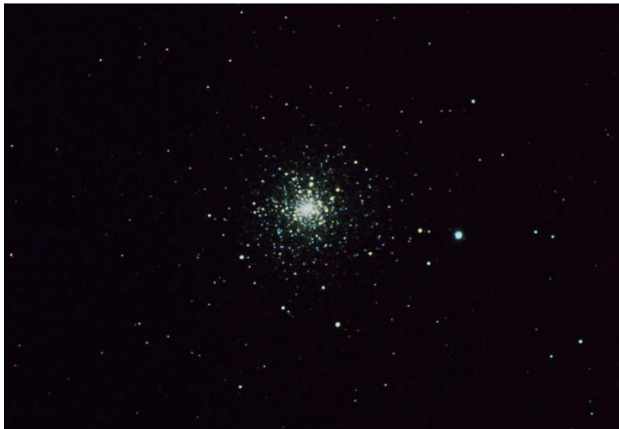
M 30 Globular Cluster, or NGC 7099, is a comet-like cluster, that moves the opposite direction to the rotation of the galaxy, probably as the result of an intergalactic gravitational encounter. Dale Liebenberg

slightly longer, giving the impression of a pair of firefly antennae. The southeastern part of the globular is broken down in starlight and in a way cut off by a short string of four stars. Also to be seen is a double star towards the southern part. Messier 30 is a large globular cluster that can be easily spotted with binoculars and measures nearly 90 light years in diameter. It is a very special object – one to remember long after observed it.