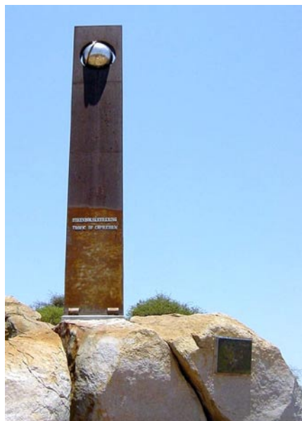
Monument marking the tropic of Capricorn outside Polokwane, Limpopo province.

The name 'Tropic of Capricornus' originates from the fact that when first ob-