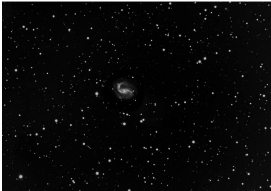
NGC 6907 Its misty glow represents a miniature Large Magellanic Cloud. Dale Liebenberg

double star. In fact, four companions are listed. Double star director Dave Blane indicate that Alpha Capricorni is an optical double star with components \alpha^1 Cap and \alpha^2 Cap having magnitudes 4.3 and 3.6 respectively. They have a separation of 381'' at a position angle of 292^\circ . \alpha^1 is a G type super-giant and \alpha^2 is a giant star of the same spectral class. Each component is in turn a multiple star, with \alpha^1 having a magnitude 9.6 companion with separation of 46.9'' at a position angle of 222^\circ , which is unrelated, while \alpha^2 has a magnitude 10.5 companion with separation 153'' at a PA of 160^\circ .