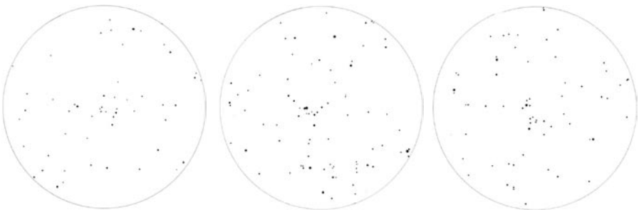
Sketches from observations done with my 12-inch telescope at 218x, yielding a field of 23 arc-minutes across, showing stars down to magnitude 14. From left to right are ESO 309-SC03, ESO 429-SC02 and ESO 429-SC13.

From giant observatories to the petite ESO 429-SC13 , a mere one degree north of the outstanding open star cluster NGC 2439, which can be used as a pointer, or direction finder. This part of the constellation Puppis is especially strewn with numbered small star clusters. The first impression of this ESO grouping is that of three stars between magnitude 11 and 12 in a N-S direction, which stand out quite clearly. The southern end boasts GSC 7106 3305 (magnitude 11.3) as the brightest member with a few fainter members towards the east. The grouping however extends to the north indicate two parts and together they extend