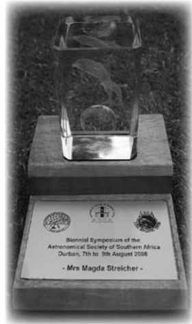
(Right) This special crystal containing a dolphin was a gift, presented to me at the Durban Symposium, which inspired me to dedicate this article to Delphinus, thence to the friendly people at the two KZN Centres.