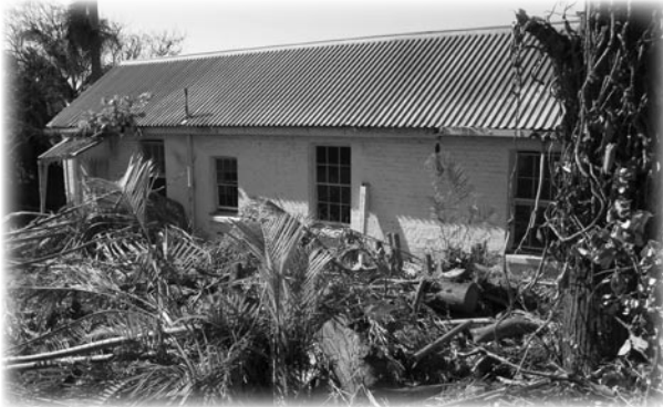
(Above) The badly neglected site of the former Natal Observatory in Currie Rd, Durban is heartbreaking.

course the deep-sky addicts among us in the form of Auke and me tried to harvest every speaker's knowledge in the finest detail. The opportunity to make new friends and to be able to attend the symposium was a wonderful privilege indeed. A gift of a crystal containing a dolphin was presented to me – a treasure that will always remind me of the symposium and of Kwa-Zulu-Natal's friendly people. ☆