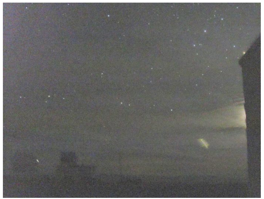
Fig. 4: Five 15-second exposures were stacked to produce this image, showing the satellite leaving a streak as it moved. The Moon was deliberately obscured by the building to try and reduce its glare.

I saw. At that time the comet-like cloud was 8.1 degrees above the horizon and at a range of about 11 500 km. I eventually managed to follow it to just 2.6 degrees elevation and 18 800 km distant, then at an altitude of 13 700 km above the Earth. The fact that it was still visible to the naked eye at this enormous distance, gives an idea of how bright it was. It is actually surprising that no sightings from further east were reported.