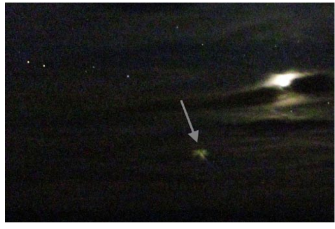
Fig. 3: A single 15 second exposure shows the fuel dump as a bright 1 degree blob (arrowed), easily visible, even with the crescent Moon close by and through thin cloud. This picture was taken at about 03:50 SAST when the 2<sup>nd</sup> stage was only at elevation 3.7 degrees and 16 700 km range. At 16 700 km radius, one degree is about 290 km, giving an idea of the actual size of the fuel cloud.

I was now wide awake and before sharing the excitement with the others, back at the