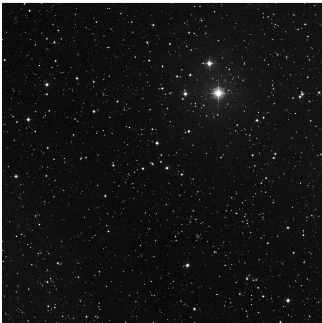
Very faint but well-formed Y shape, comprising of nine tenth magnitude starlets seen in a wide field of view. The open end of the Y faces northeast. Three prominent bright stars are situated snugly together in a triangle to the north of the field of view.