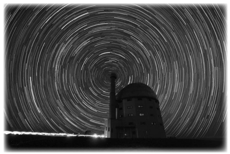
For this picture, Steve Potter (SAAO) placed SALT's alignment tower at the South Celestial Pole. The image is a composite of numerous 40-second exposures which, after a few hours, show up as circular star-trails due to the Earth's rotation.

My sentiments go back to the old seafarers who, in ideal conditions, actually saw Octans's brighter stars revolving around the pole, assured of the fact that they were sailing southwards. The northern-most heel point, completing the constellation's triangle, is the double star Nu Octantis which is fairly bright and easily visible, even with low magnification. The double star consists of two yellow 8.5 and 8.8 mag stars, with a convenient 17.3" separation in. Alfa Octantis can be seen 2 degrees NW, which, at a 5.2-magnitude, is fainter than the double star Nu Octantis. A little further NW are Mu 1 and 2. two beautiful, easily visible butter-yellow stars, underlined by a string of faint stars in an E-W direction. The northern part of